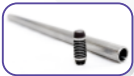
High Quality Stainless Steel Tube and Bullet